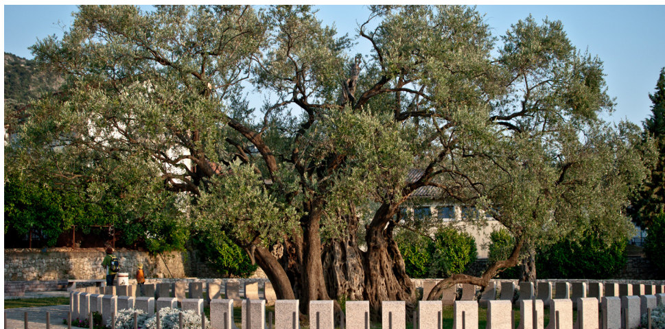
/ AN OLIVE TREE IN BAR

The last fjord of the Mediterranean, renowned for its natural beauty and rich cultural heritage.