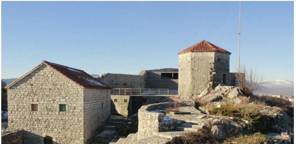
/ BEDEM FORTRESS

Ski Resorts: Montenegro has the closest ski resort to an international airport in Europe, making it an attractive winter destination.