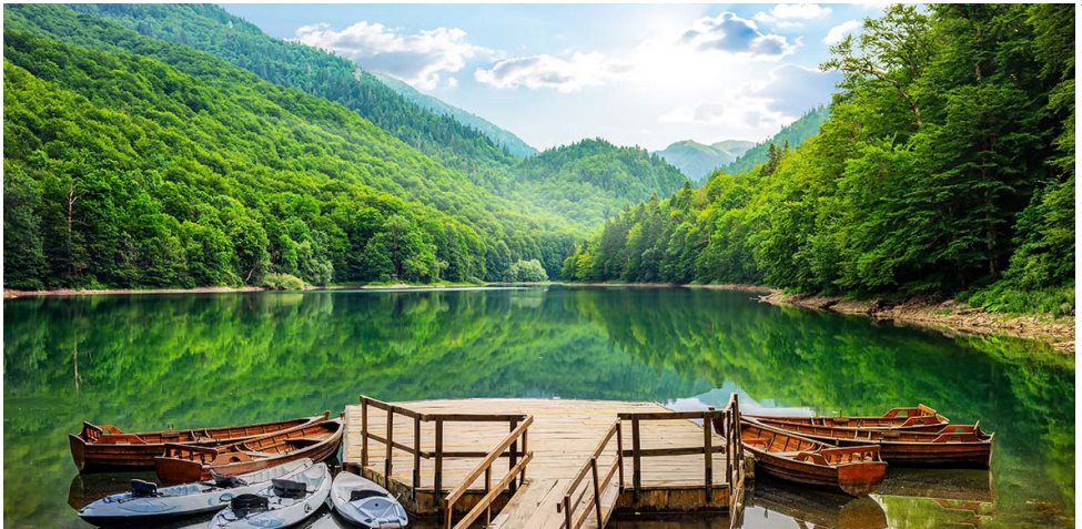
/BIOGRADSKA GORA NATIONAL PARK

The deepest canyon in Europe and the second deepest in the world, often called the “Tear of Europe”.