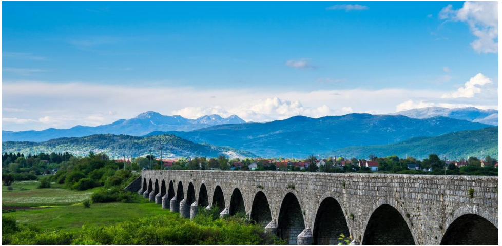
/ THE EMPEROR'S BRIDGE

Built in 1894 on the Zeta River, the bridge spans 263 meters with 18 arches and is one of the most beautiful stone bridges in the region.