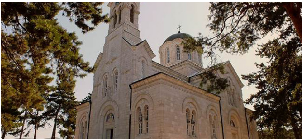
/ CATHEDRAL OF ST. BASIL OF OSTROG

One of the most significant archaeological sites, with artifacts from the prehistoric period.