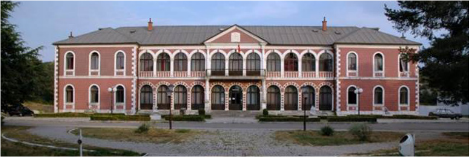
/ KING NIKOLA'S PALACE

A magnificent building from 1899, now housing a library, gallery, and museum.