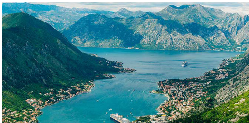
/ BAY OF KOTOR

The last fjord of the Mediterranean, renowned for its natural beauty and rich cultural heritage.