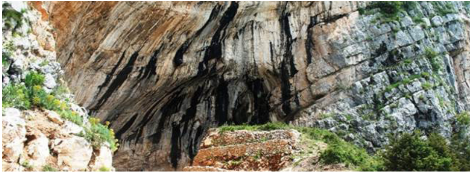
/ ORVENA STIJENA (RED ROCK)

A magnificent building from 1899, now housing a library, gallery, and museum.